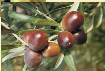
Cultivar: Olea europea sativa (variety: Dolce di Rossano, Carolea, Tondina)